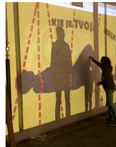
Students from Budapest, Cracow, Belgrade, Rijeka and Nova Gorica were Mapping the Borders , their own but also the local border between Slovenia and Italy in the twin towns of Nova Gorica and Goric.