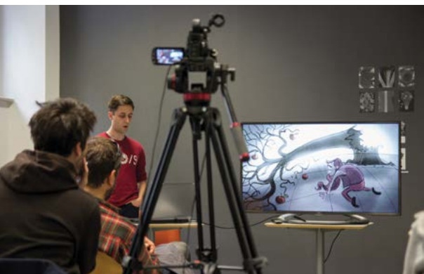
Student present or pitch their diploma and MA graduation projects in different production stages for colleagues and mentors.

We value the student as an independent and creative personality who develops in the group, within a community. With innovative approaches in pedagogic, research and production processes, we encourage independent creative and academic work supervised by an open group of experts. Mentors and guests are carefully chosen based on their excellence in contemporary practice as well as academic credentials, which ensures that the knowledge and skills we share with students are relevant and of a high quality. To learn more about the teachers, visit the web page //au.ung.si/en/educating/people . Project-based work and production