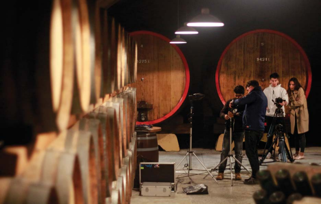
Filming a promotional film with mentorship of director and artist Jasna Hribernik, assistant professor. The study process often brings students together for group projects to try out a variety of roles under the supervision of specialized mentors. In case of film, for example, they develop the plot, design the set, create the lighting and determine the camera setup, act and last but not least direct, edit and later finalize the film in post-production.

Videofilm is a portmanteau increasingly used in the quest for new terminology, necessitated by changes brought about by new technologies and new subjects. In our example it also serves as a distinction: in the Videofilm module the emphasis is on the storyline and the film and TV realms, while other dimensions of video as a medium of expression are explored and developed by students in combination with other modules (for example Contemporary Art Practices).