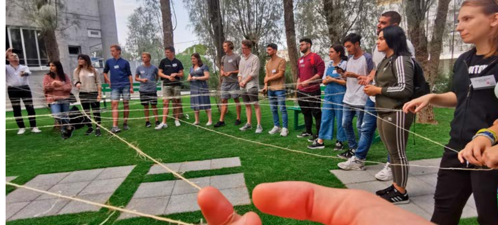
Introductory session at the EmindS workshop on Cyprus, where students of Nova Gorica joined forces with colleagues of other courses from the Graz, Helsinki, Solun and Nicosia.

As students progress along their studies, the three-year bachelor's programme in Digital Arts and Practices and the two-year master's programme in Media Arts and Practices, they navigate the realms and carrier modules of animation, photography, (video)film, new media, scenographic spaces and contemporary art practices; in the master's programme they can also take courses at partner universities abroad.